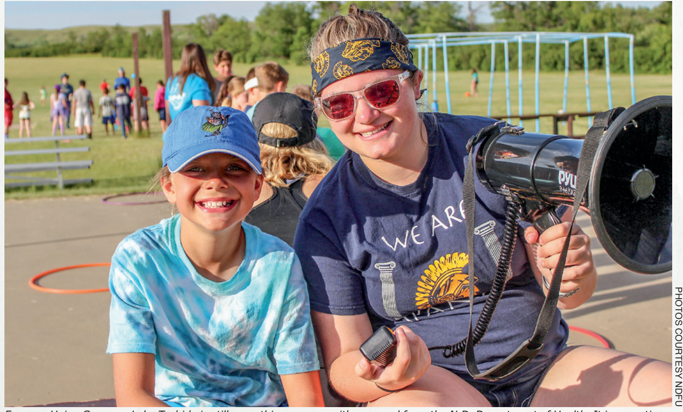
Farmers Union Camp on Lake Tschida is still open this summer, with approval from the N.D. Department of Health. It is operating at half its normal capacity to separate kids into smaller groups due to the pandemic. NDFU is cooperative- and community-oriented. During youth camps, kids learn about cooperatives, teamwork, leadership, and the importance of giving back to their home towns. In return for their participation, the kids can earn awards and trips.