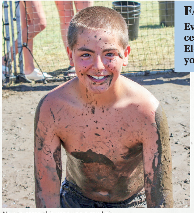
New to camp this year was a mud pit.

"We need to keep our youth involved," she says. "They can still be social and talk to one another, and we can all keep moving forward."